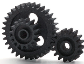
Picture taken after dye post-processing